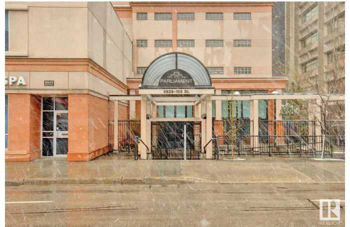
805-9939 109 St NW, Edmonton, AB