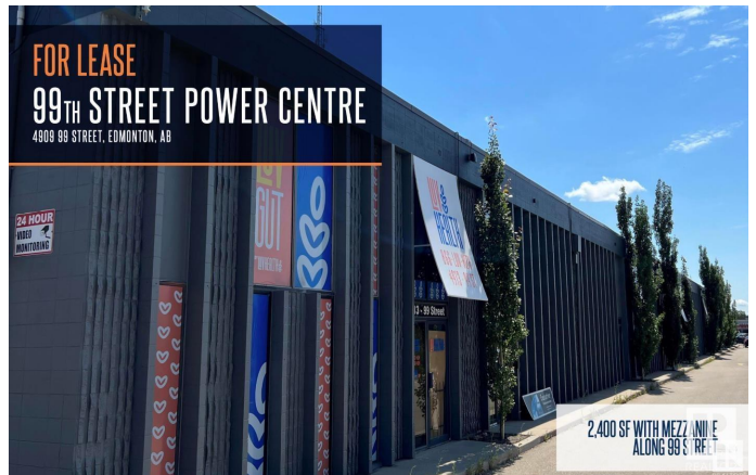
FLOOR PLANS / 99TH STREET POWER CENTRE 4809 99 STREET, EDMONTON, AB